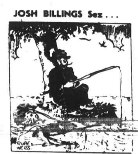
he man who never makes enny mistakes,