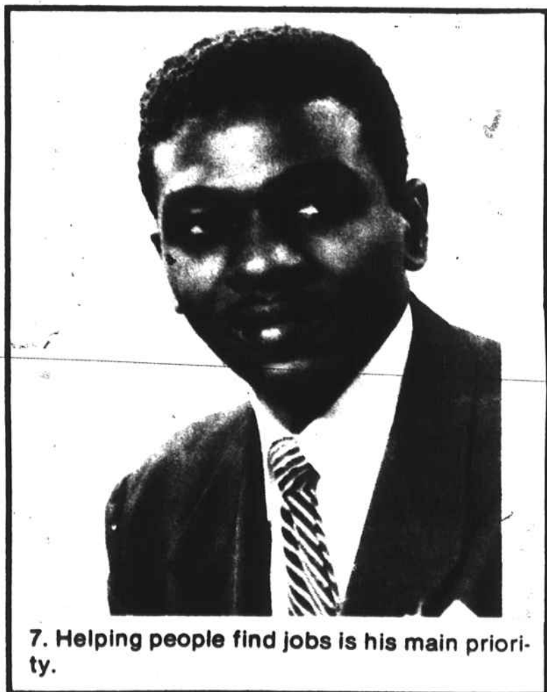
7. Helping people find jobs is his main priority.