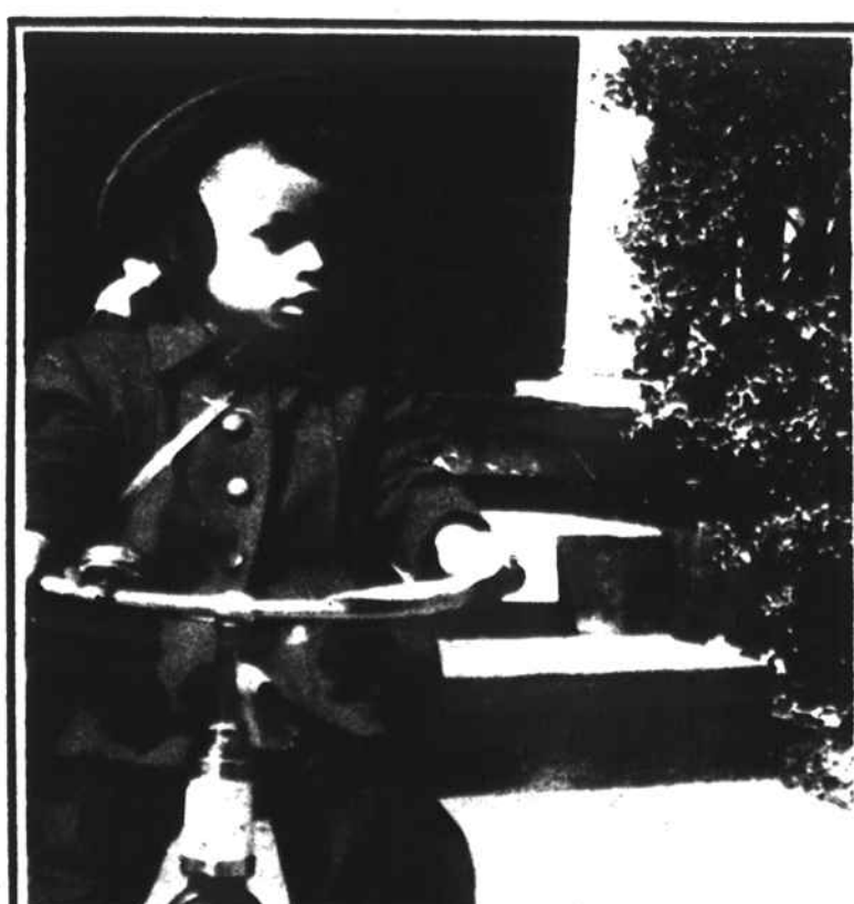
11. When she got fed up with crime, she did something about it.