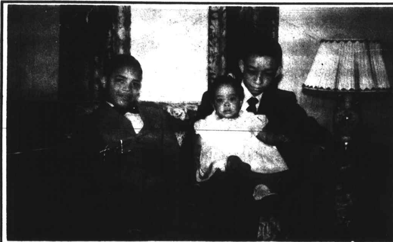
8. If exercise is what you need, he has the place for it (boy on left).