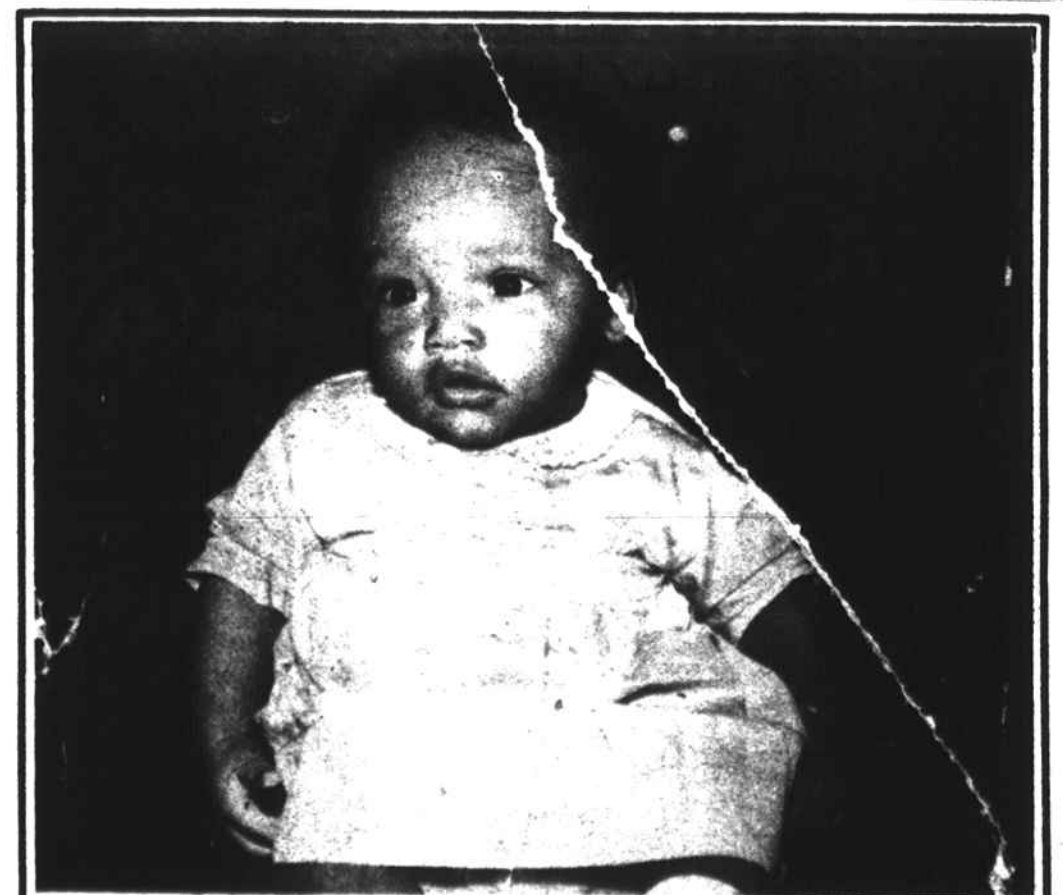
10. His friends know him better as "Sweet Weasel."