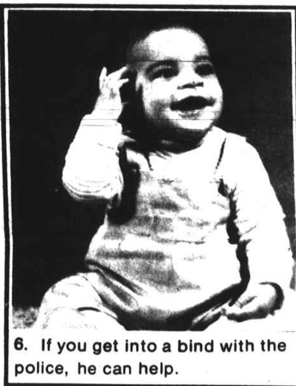
6. If you get into a bind with the police, he can help.