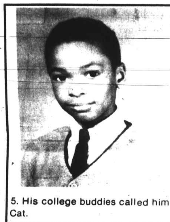
5. His college buddies called him Cat.