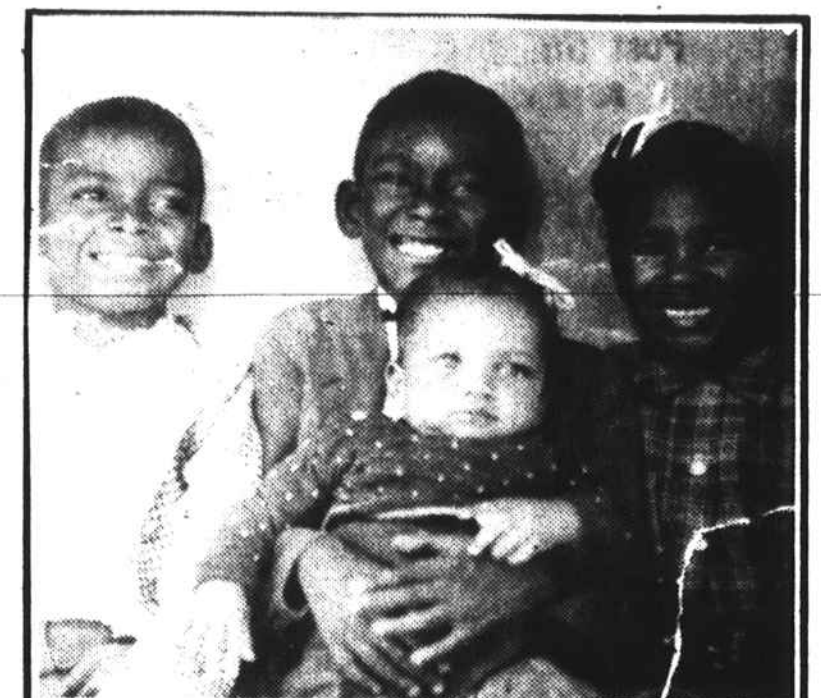
9. Even though he's much older, he's never given up playing (boy on left).