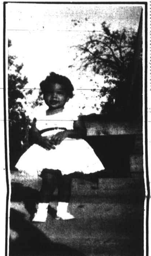
4. If music soothes the savage beast, she can tame the wildest.