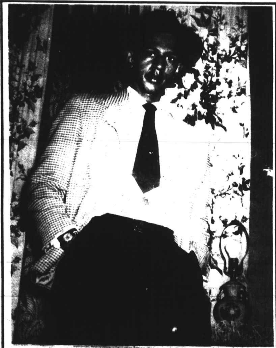
1. When something goes wrong at school, he's the one to call on.

Every once in a while looking back at old pictures is fun and entertaining. The people below are all well known, many look the same and others have changed considerably. Only enough clues are given to whet the appetite. When you give up, turn to page B8.