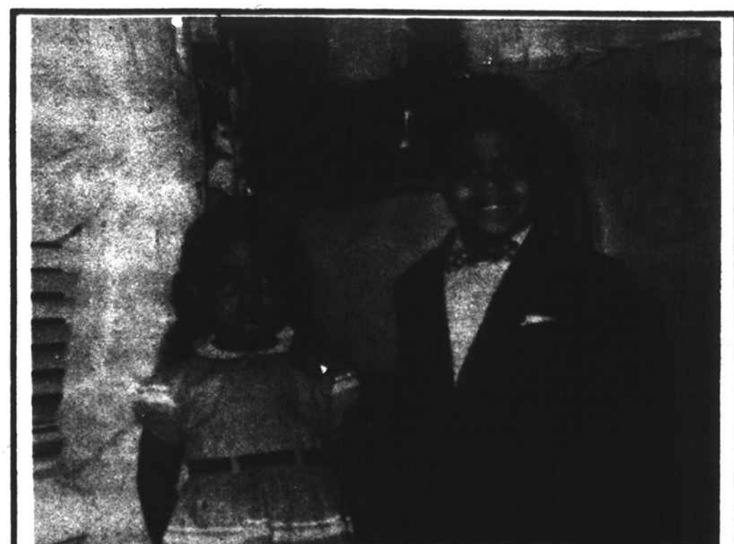
12. As a first in her field, she too can help when the temperature soars (girl on left).