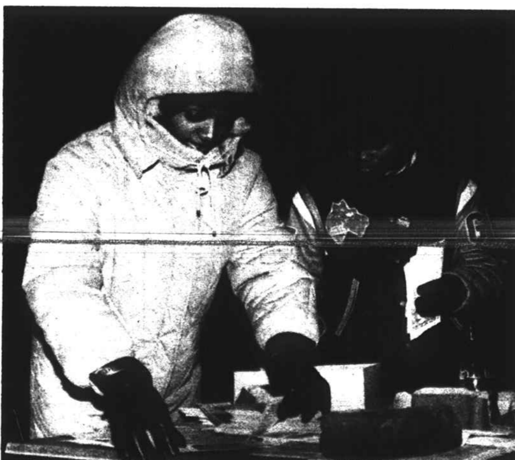
Twilight Zone: Winston-Salem State students hand out Martin literature for pay at the Carver precinct.