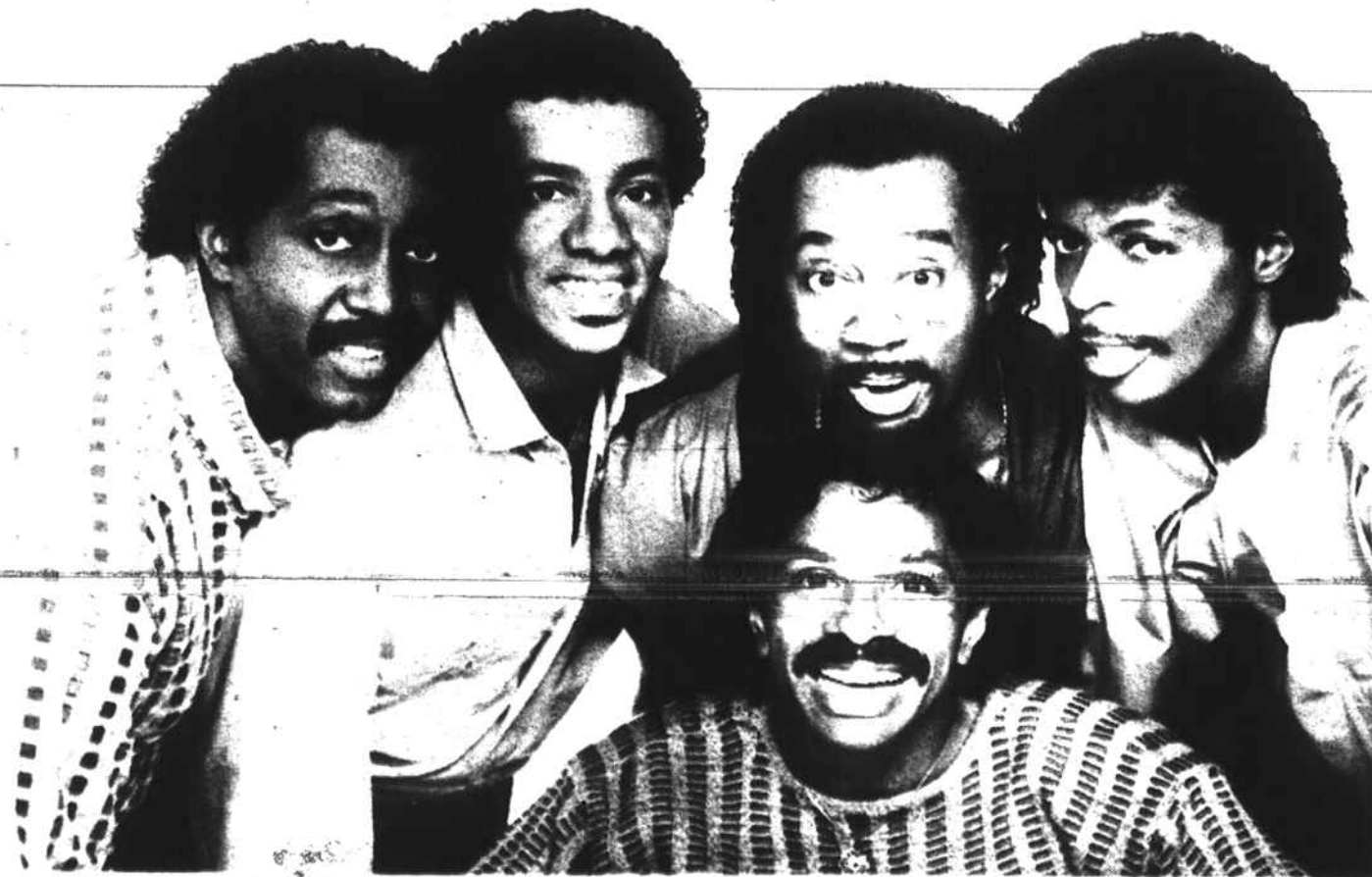
Over the years the Temptations have changed faces but the sound is still the same.

Dennis Edward joined the group in 1967 after Please see page B12