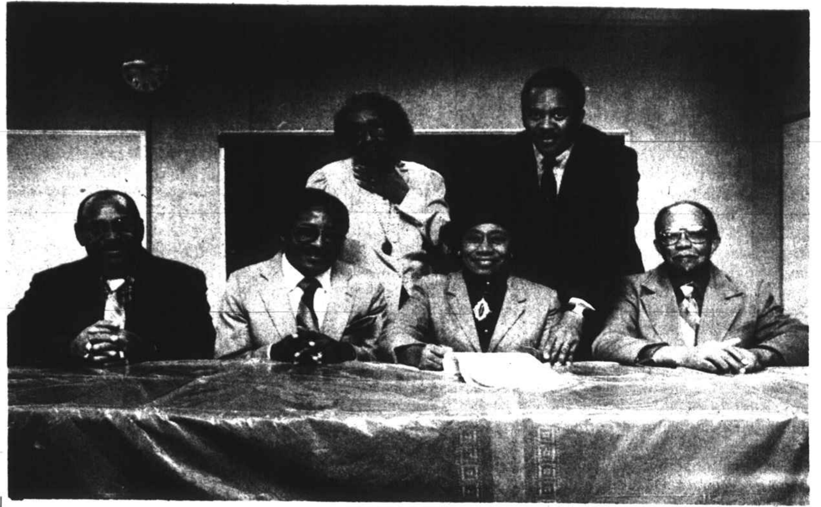
A joint committee of The Shilohian-St. Peter's Corporation Family Care Center plan for the center's opening.