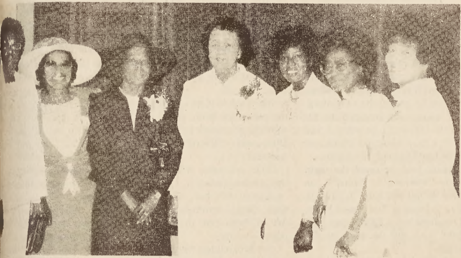
Members of the Winston-Salem chapter of the National Council of Negro women join the national president, Dr. Dorothy Height, after her speech at First Baptist Church.