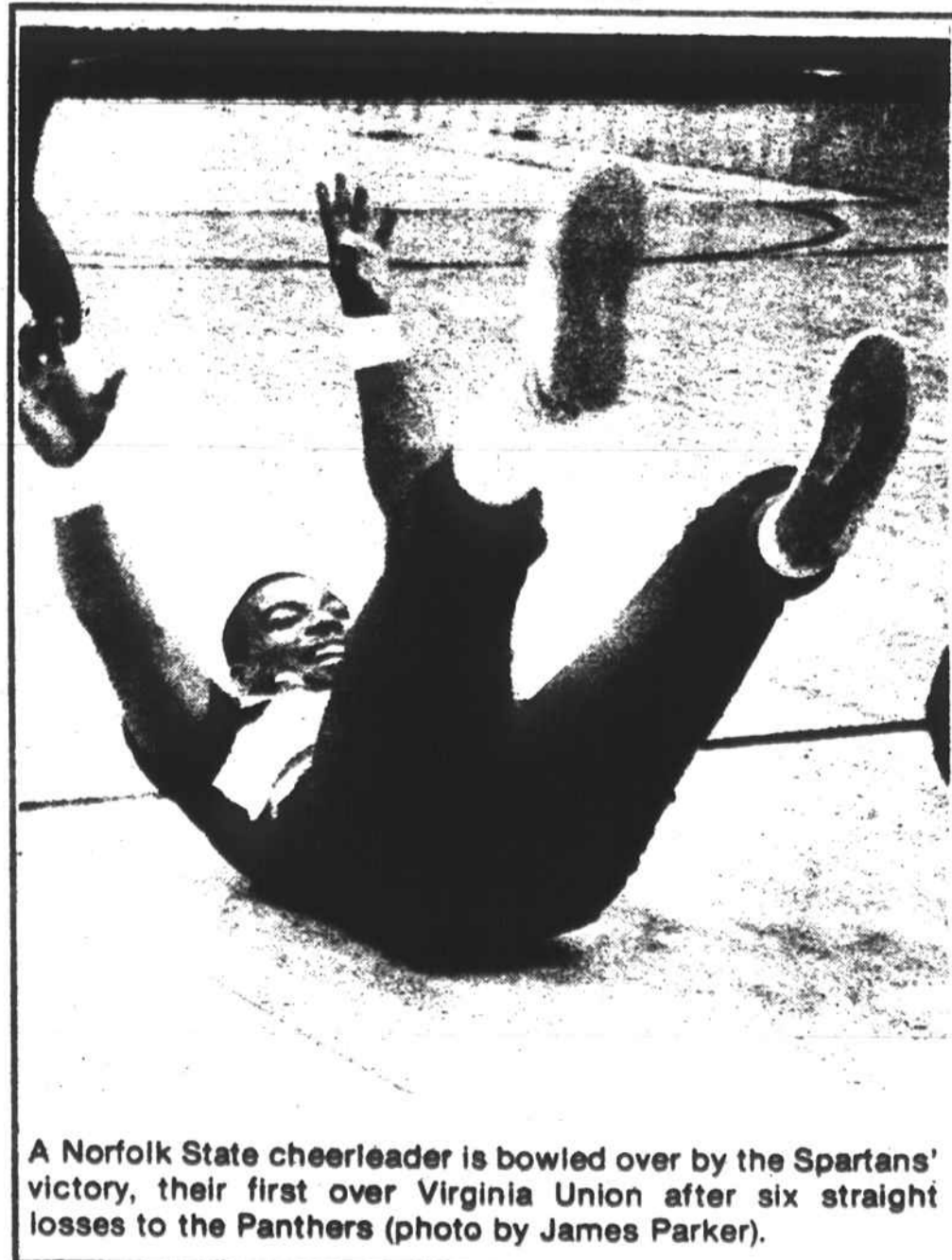
A Norfolk State cheerleader is bowled over by the Spartans' victory, their first over Virginia Union after six straight losses to the Panthers.