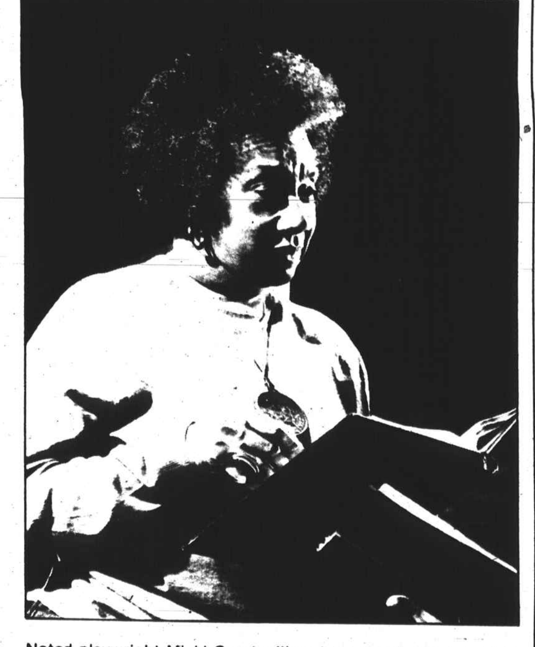
Noted playwright Micki Grant will make a guest appearance in Winston-Salem during the encore performance of her play, "Don't Bother Me, I Can't Cope."