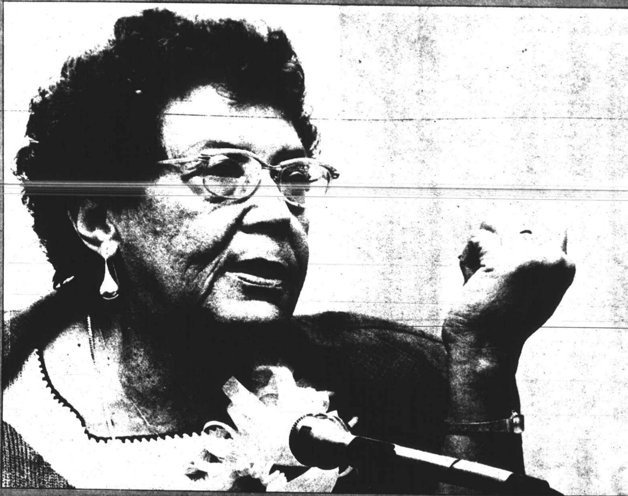
Artist Elizabeth Catlett delivered the keynote address at Friday night's public meeting, held in the Benton Convention Center.

The 13th South Atlantic Regional Conference of Delta Sigma Theta Sorority Inc. was held last weekend, with approximately 1,300 Deltas attending the four-day event.