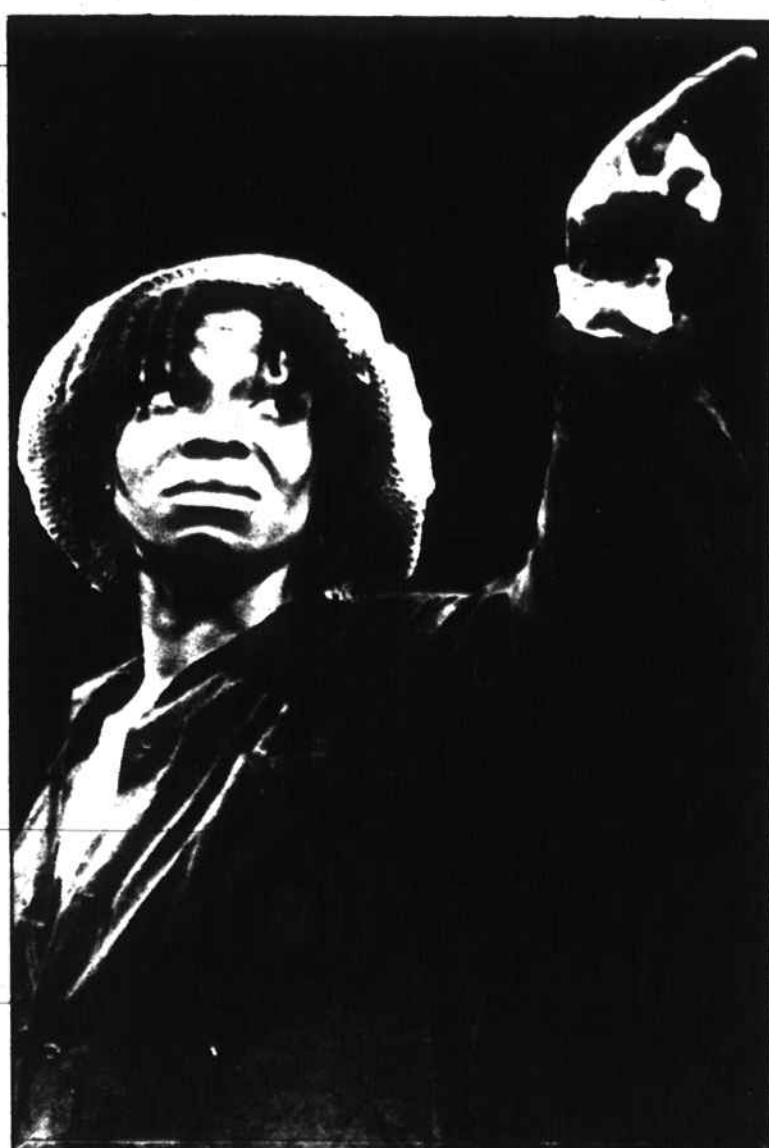
Whoopi Goldberg, in her third starring movie role, will play a detective.

To be filmed on the streets of Los Angeles.