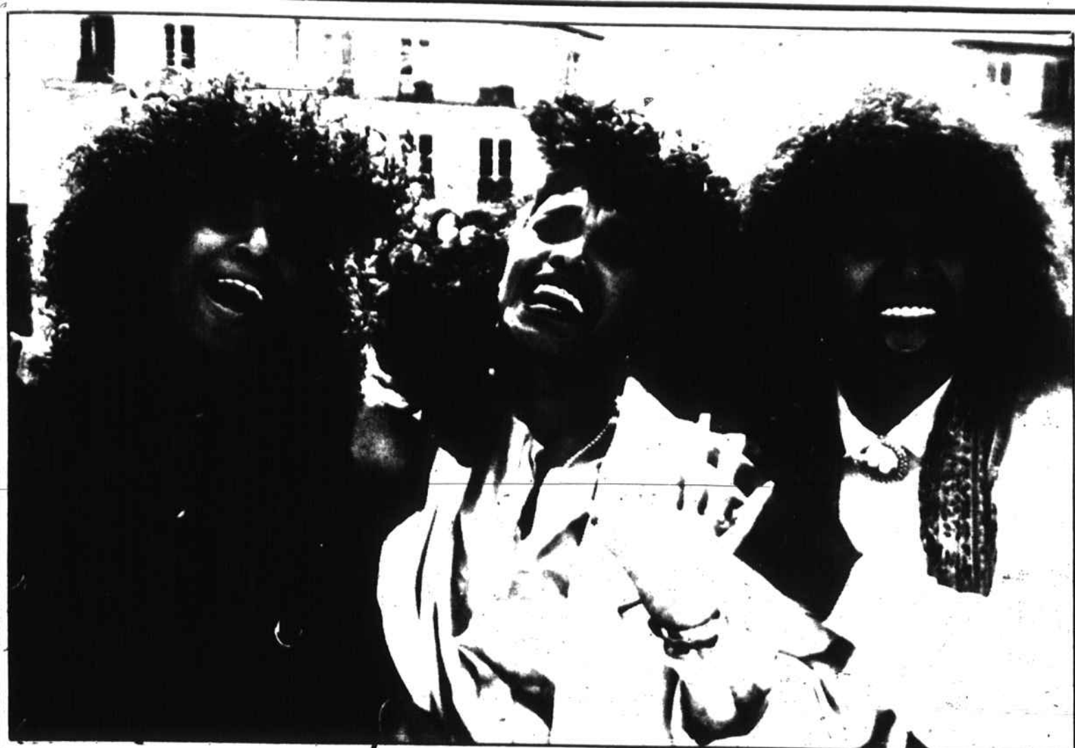
The Pointer Sisters hope to do more television appearances and less recording to make time for their personal lives.