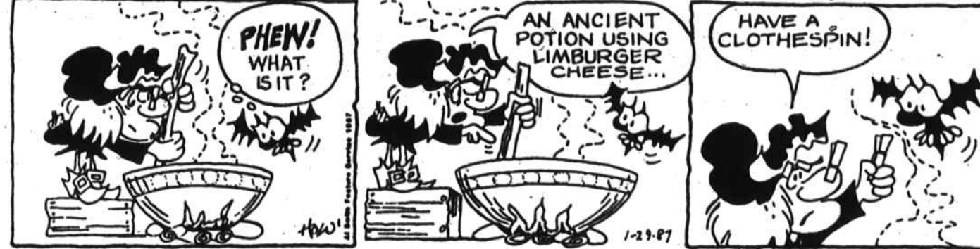
IT JUST SO HAPPENED