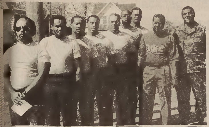
embers of the Omega Lampados Club of Psi Phi Chapter recently volunteered their service dresses on some of the city's street curbs.