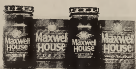
This food for thought is brought to you by Maxwell House® Coffee, a supporter of America's historically Black colleges.