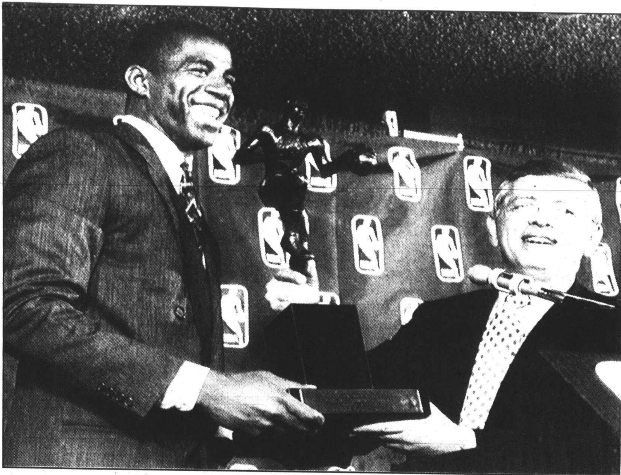
Magic Johnson, the all-purpose performer for the LA Lakers, receives this season's NBA MVP Award from league commissioner David Stern.