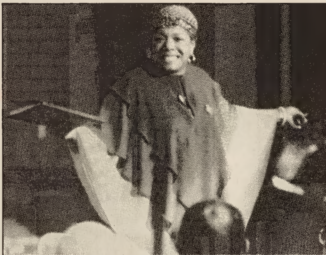
Maya Angelou will deliver the keynote address at a Black Arts in America Conference this spring.

Ms. Angelou will discuss the blackening of America at a dinner Friday, March 30, at 6 p.m. in Muse Banquet Hall. A poet, playwright, bestselling author, actress, director and civil rights activist, Ms. Angelou has written 10 books, including "I Know Why the Caged