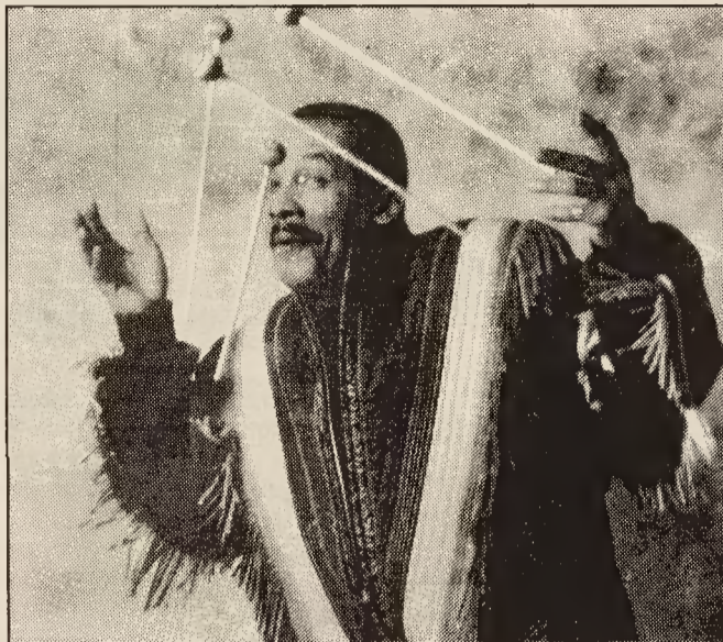
Vibraphonist Roy Ayers, above, and activist Dick Gregory, at left, will be among the featured guests appearing at WSSU to celebrate Black History Month.

cert is $4 for students and $5 for faculty, staff and the general public. Admission to all other lectures is free.