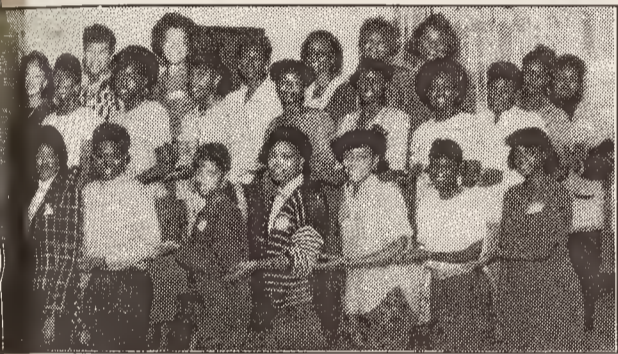
Members of WS Alumnae Chapter of Delta Sigma Theta gather with Jabberwock contestants.

The Jabberwock contestants of the Winston-Salem Alumnae Chapter of Delta Sigma Theta Sorority Inc. attended the annual University Day sponsored by Winston-Salem State University Saturday, Oct. 6.