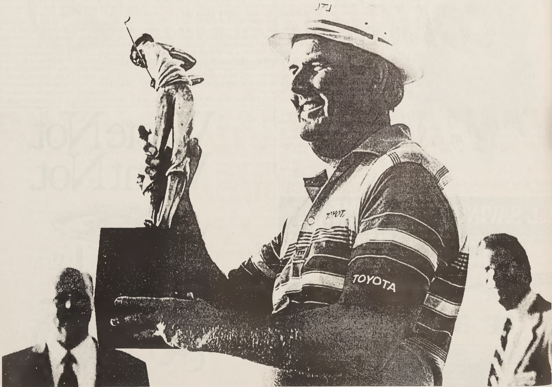
The strongest field in years. One of the toughest layouts in the country. And the pressure of playing for the Senior PGA TOUR's richest prize. Congratulations to the man who mastered them all in winning the 1990 Vantage Championship. And special thanks to all the volunteers who made this year's tournament such a resounding success.