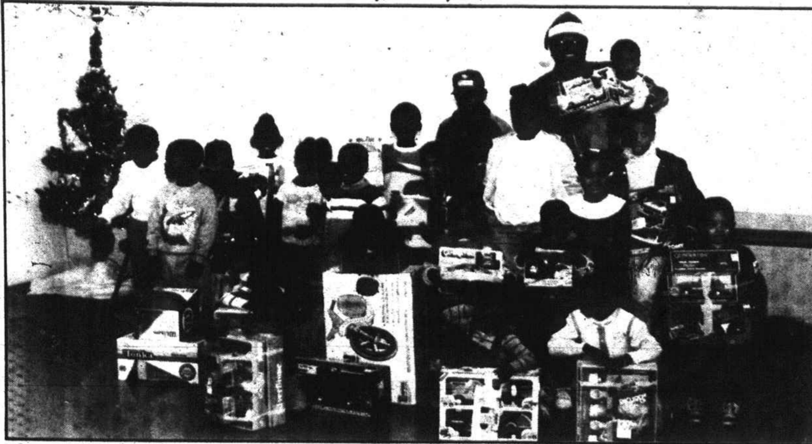
Displaying the gifts they received are Winston-Salem area children who participated in the third annual Christmas party.