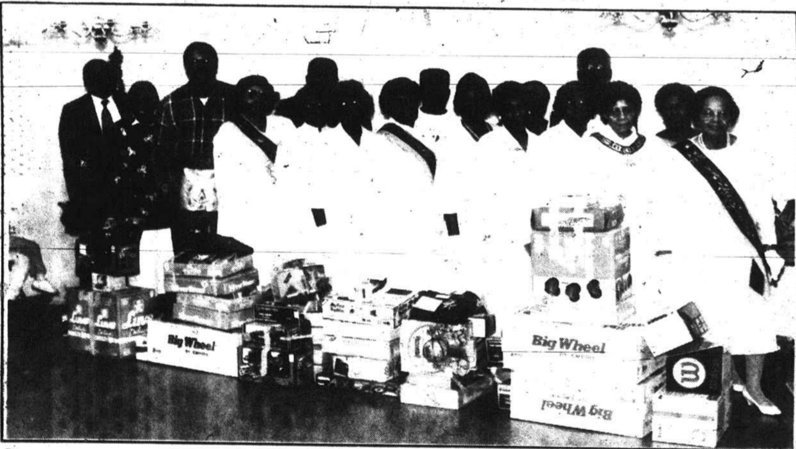
Spreading Christmas cheer by assisting in the distribution of gifts are members of The Olympic Lodge No. 795 and The Queens of Olympic No. 620.