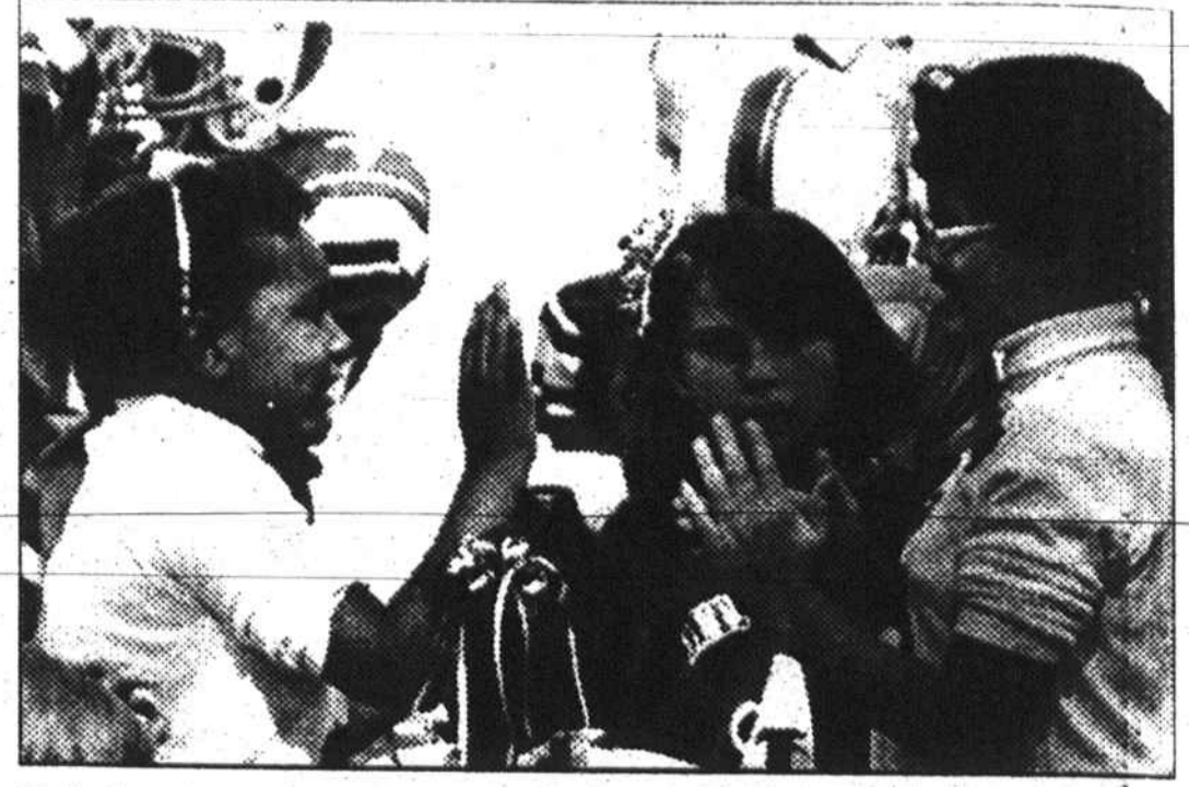
In between games, the Falcons Junior Pee Wees cheerleaders get involved in a quick game of Patty Cake.