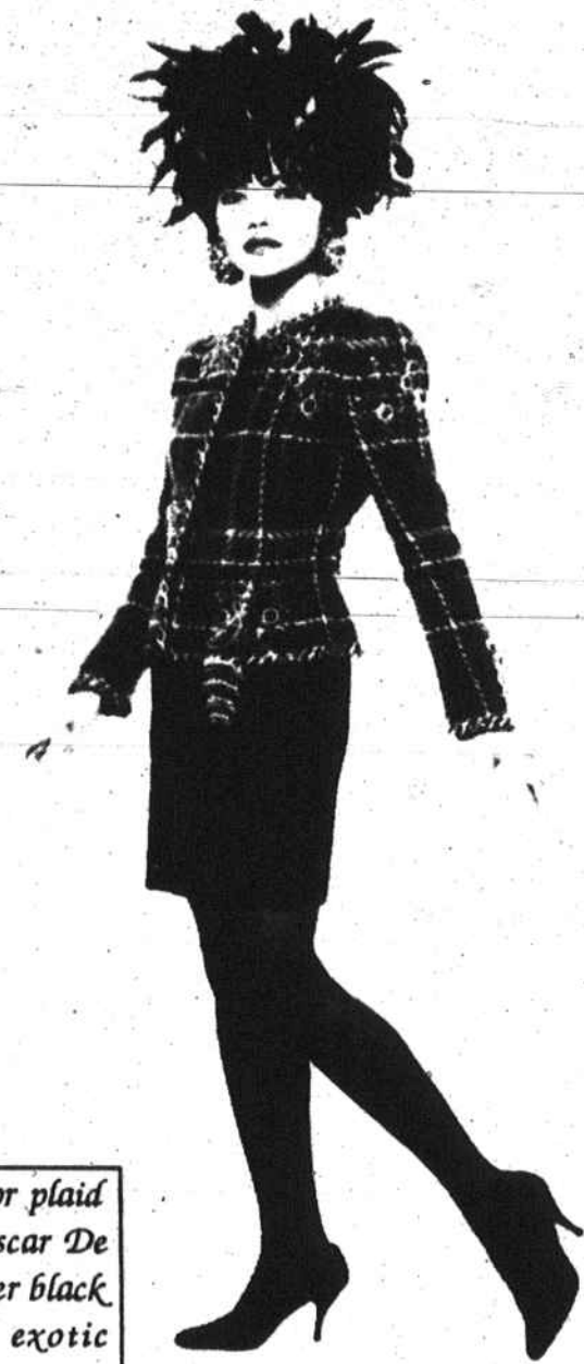
Decorative multi-color plaid jacket designed by Oscar De La Renta is worn over black velvet skirt with exotic feather hat.

461 North Cherry Street, Winston-Salem, N.C. 27101