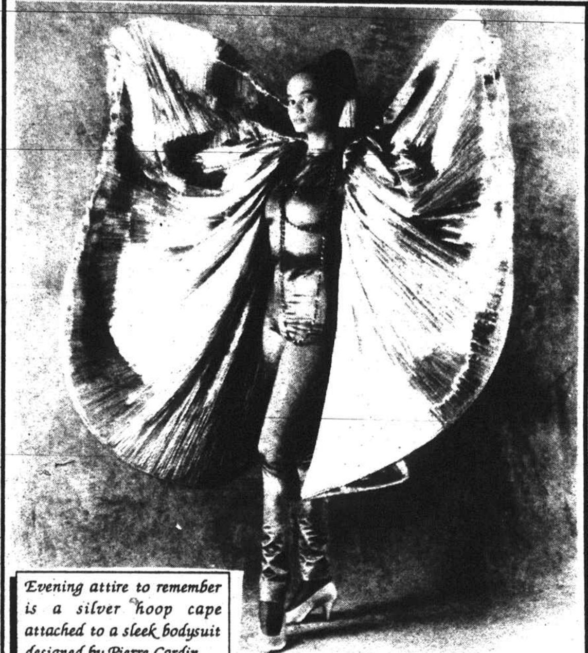
Evening attire to remember is a silver hoop cape attached to a sleek bodysuit designed by Pierre Cardin.