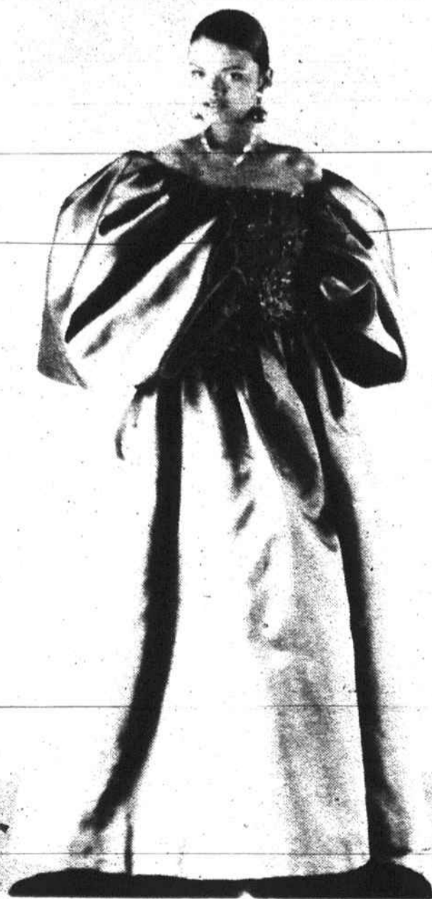
Dramatic elegance in tangerine, green, fuchsia and gold ballgown designed by Yves Saint Laurent with bell sleeves and jeweled bodice.