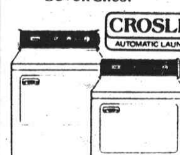
13" and 19" Models