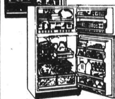
Seven Upright Seven Chest