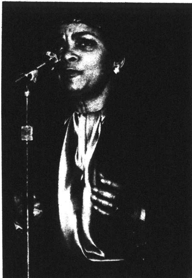
Award-winning actress Ruby Dee spoke recently to the drama students at the North Carolina School of the Arts.