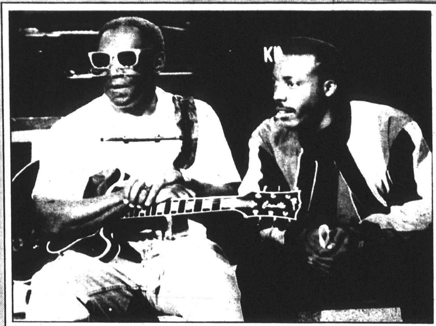
Wearing sunglasses to fit the traditional image of the blues guitarist, Bill Cosby chats with talk show host Arsenio Hall during taping of Hall's show in Los Angeles Monday. Cosby sang and played the blues with Hall's house band, "The Posse," during the entire show. Under the sunglasses are Cosby's regular glasses.