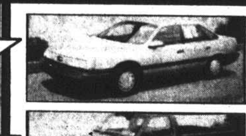
1990 Ford Taurus 4DR

All our used vehicles carry a 3 month, 3,000 mile powertrain warranty.