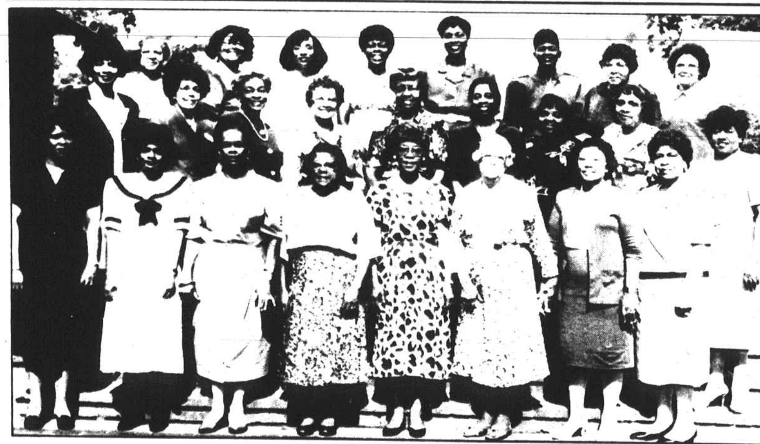
Winston-Salem State University Alumnae members who attended the Delta National Convention.