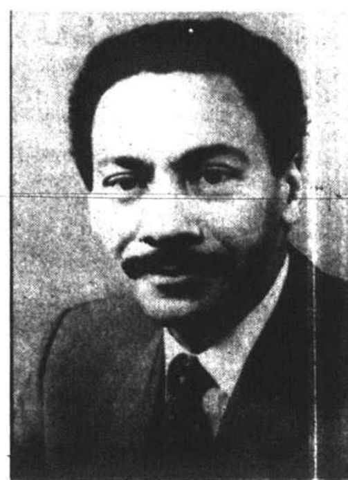
12th Congressional District candidate Mel Watt will attend the continental breakfast.