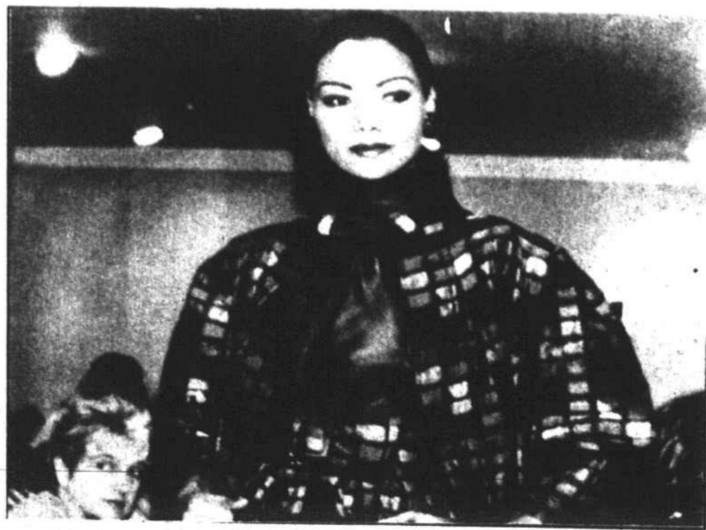
special chartered Greyhound bus. Because of the unprecedented demand for sponsorship of the show by charitable organizations around the country, Ebony Fashion Fair now tours two seasons — the East and Midwest from September through December and the South and West from January through May — appearing in more than 190 cities.

Exquisite garments complete with the latest accessories, 10 female and two male models, commentator, music director, stage and business managers, and wardrobe staff travel from coast to coast on a