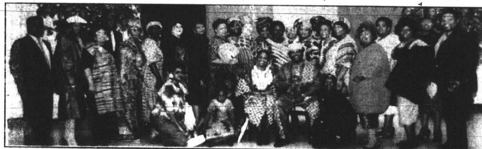
Models and narrators shown here participated in the full-figured fashion show at Mount Zion Baptist Church.