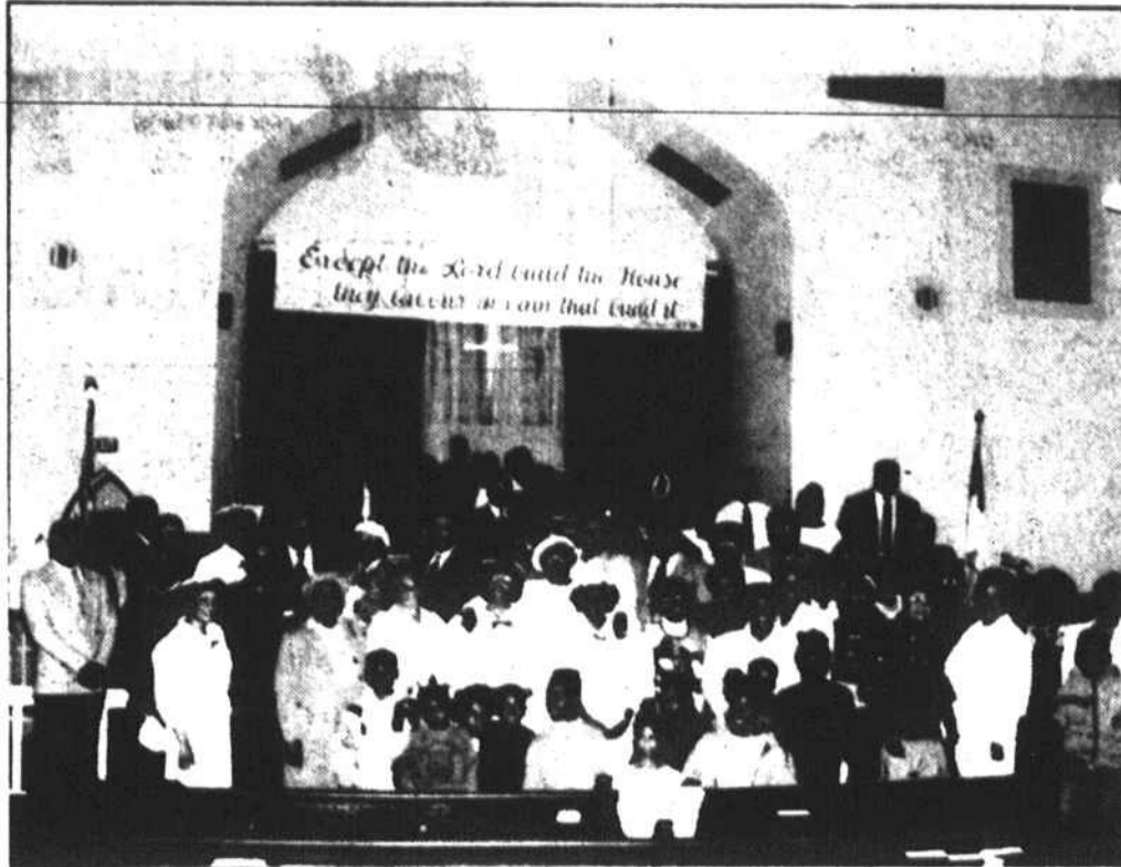
Members of Goler Memorial A.M.E. Zion Church participated in the Christian Education Department's first Leadership Training Institute.