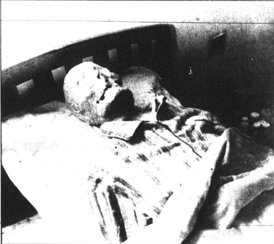
Glenda Wharton-Little's art installation is a participatory includes pleasant and unpleasant images from childhood.

The public is invited to attend. There is no charge for admission.