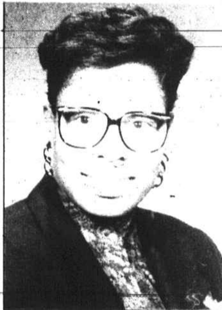
Marcia L. Fudge, Esq., National First Vice President of Delta Sigma Theta Sorority, Inc. (WSSU) and Gamma Phi (WSSU), will also participate in the program.