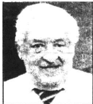
Mary McLeod Bethune