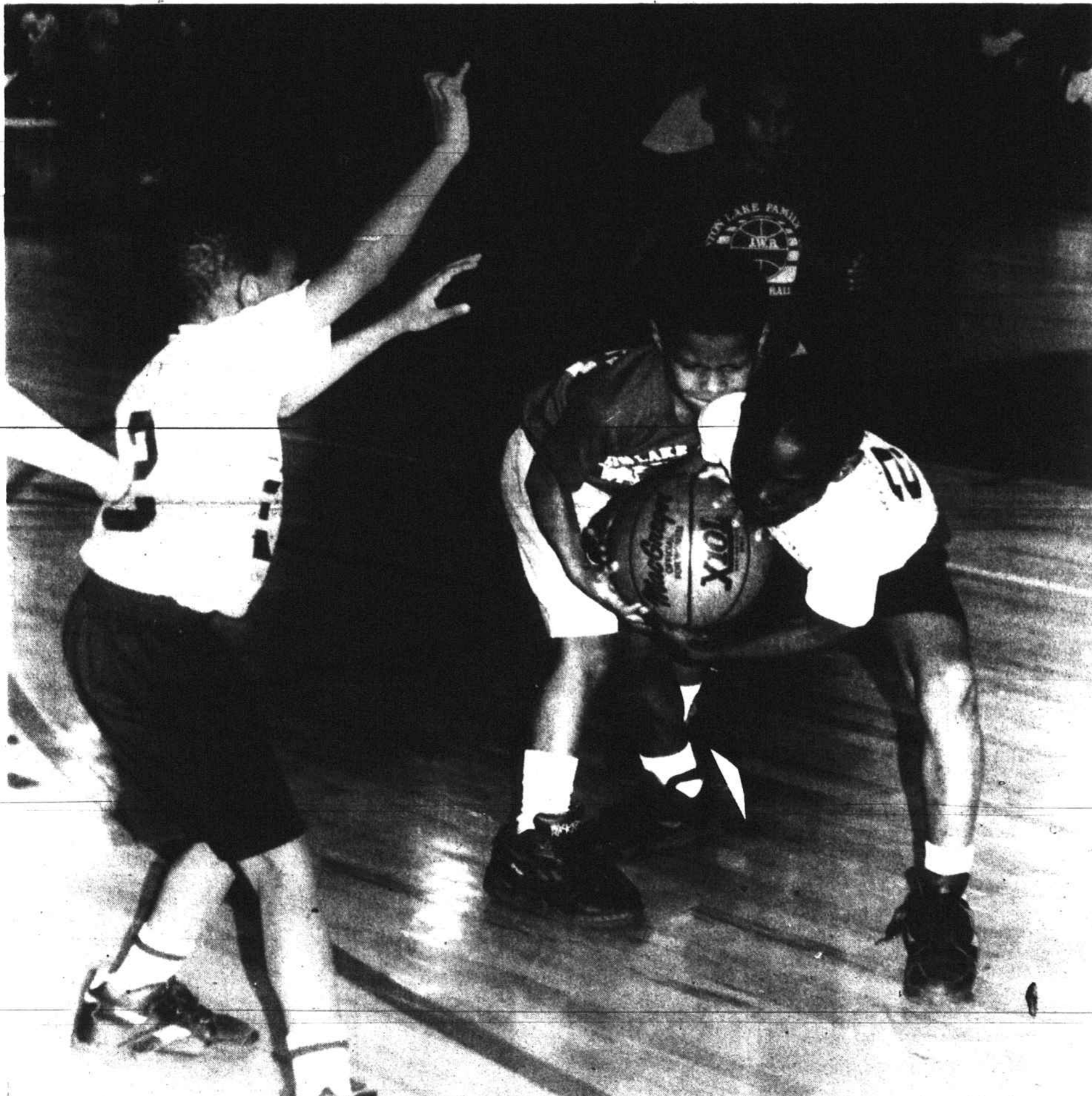
Playing in the Winston Lake YMCA 5-8 year-old basketball tournament, players express faces of determination as both teams showed strong defensive action from the floor as they struggle for ball control. See Winston Lake Youth Action next week for more photos and stories.