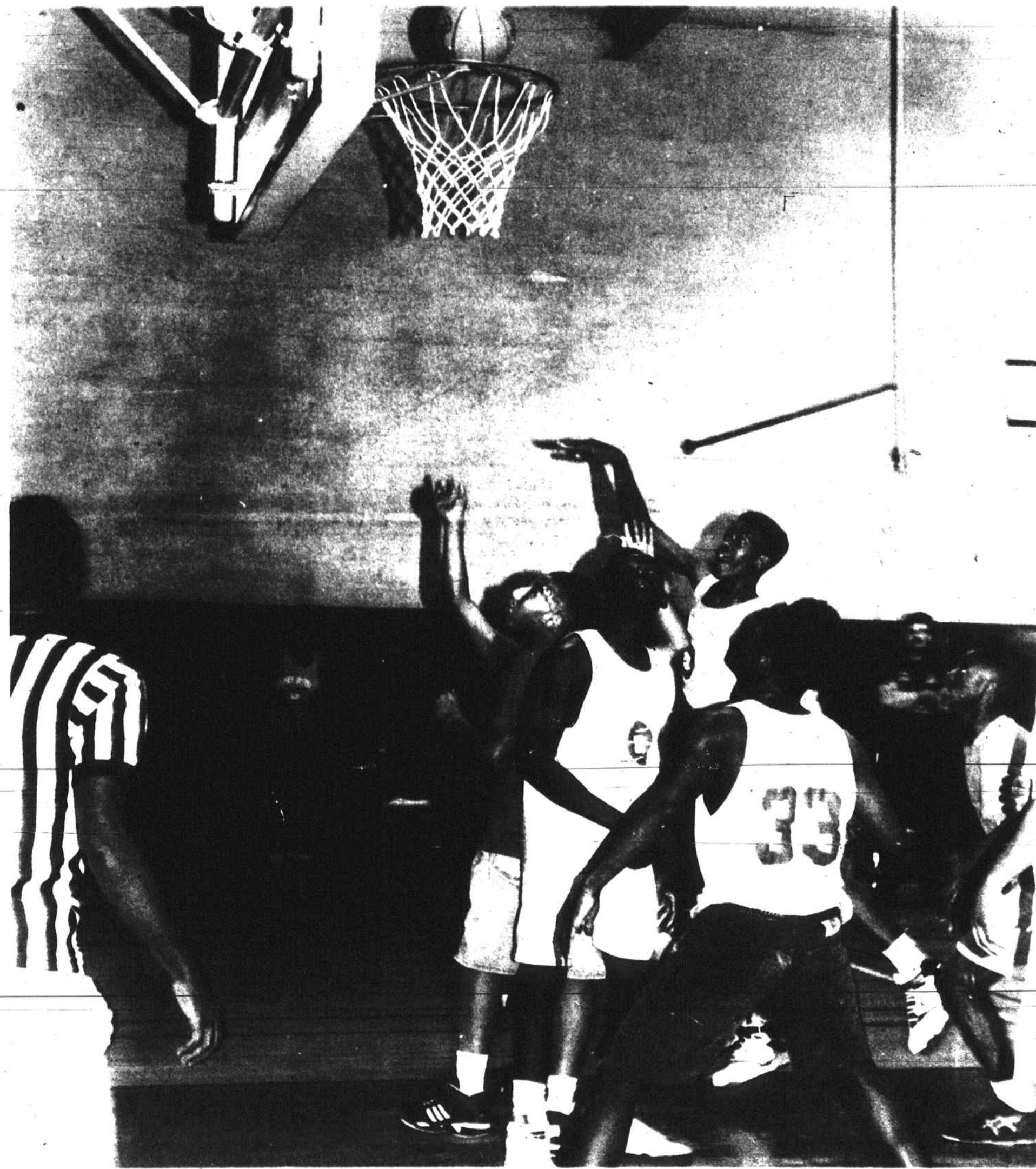
Hanes Hosiery All-Stars compete in Special Event Basketball Tournament