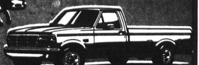
1993 F-150 XLT LARIAT