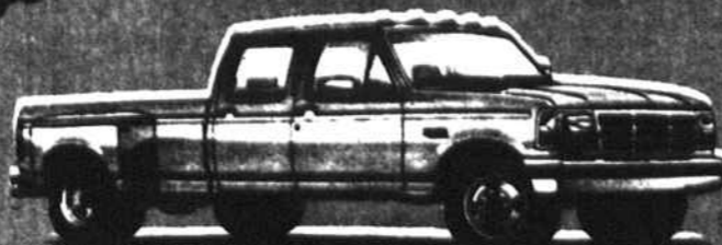
1993 F-350 CREW CAB