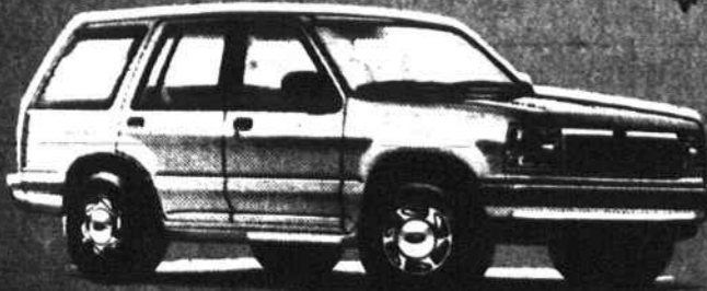
NEW MODEL!! 1993 EXPLORER LIMITED