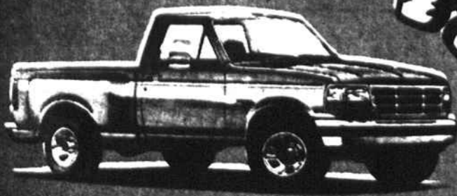
ALL NEW MODEL! 1993 F-150 "LIGHTING"