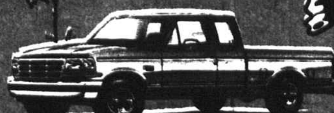
1993 F-150 4X4 SUPER CAB