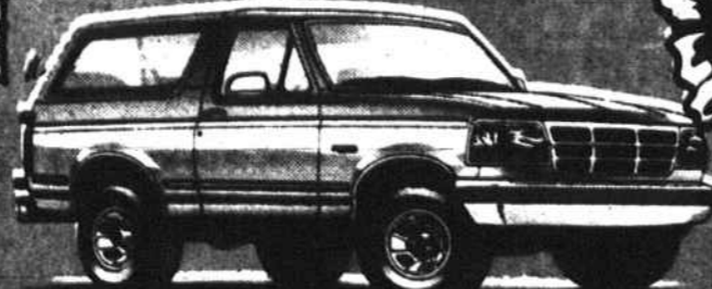
1993 BRONCO XLT