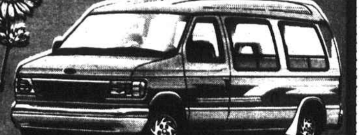
$6,600 DISCOUNT! 1993 SHERROD CONVERSION VAN