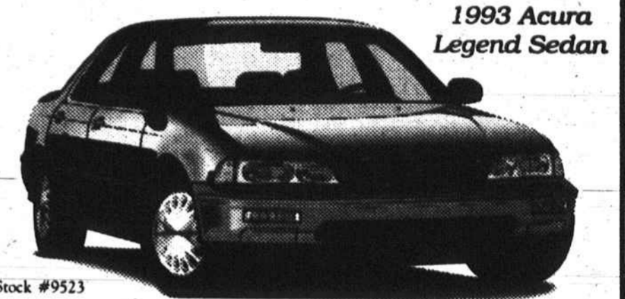
1993 Acura Legend Sedan

WHY OUTSPEND YOUR NEIGHBORS WHEN YOU CAN OUTSMART THEM INSTEAD.