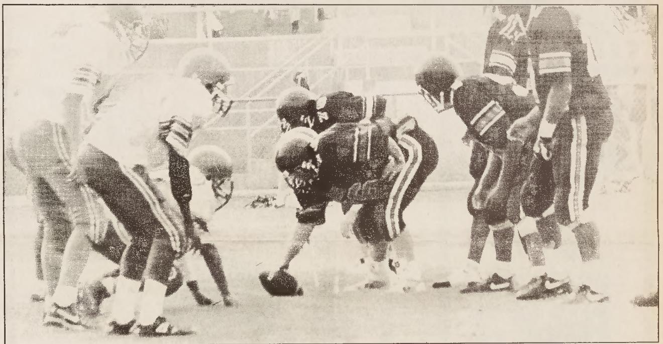
It was Demon control throughout the entire game against Parkland's junior varsity Mustangs.

East's JV football team will travel to West Forsyth tonight for a game at 6 p.m.