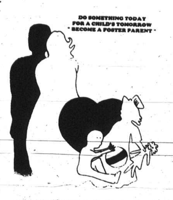
FORSYTH COUNTY DEPARTMENT OF SOCIAL SERVICES FOSTER HOME SERVICES