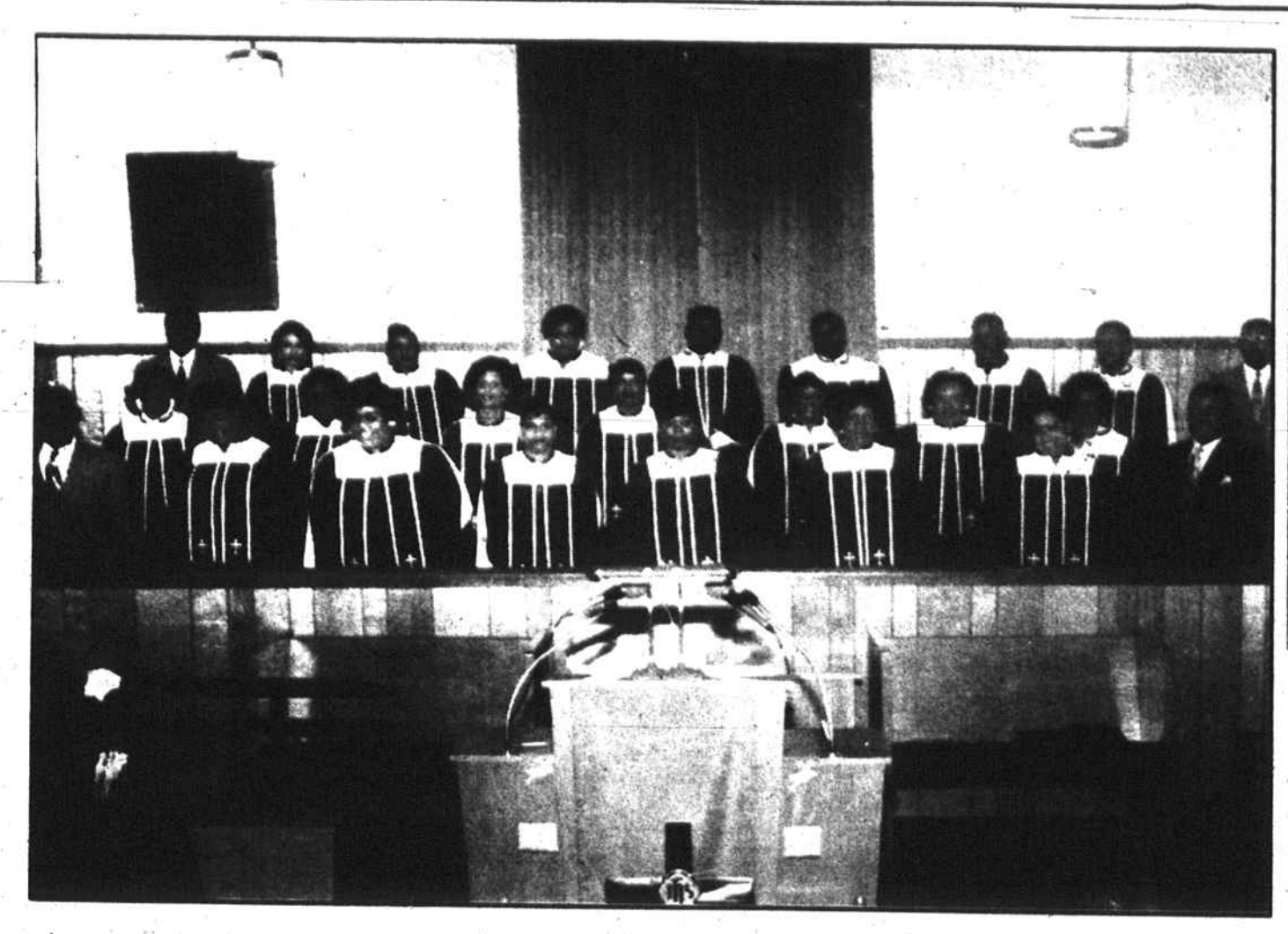
The Inspirational Choir of Morning Star Baptist Church