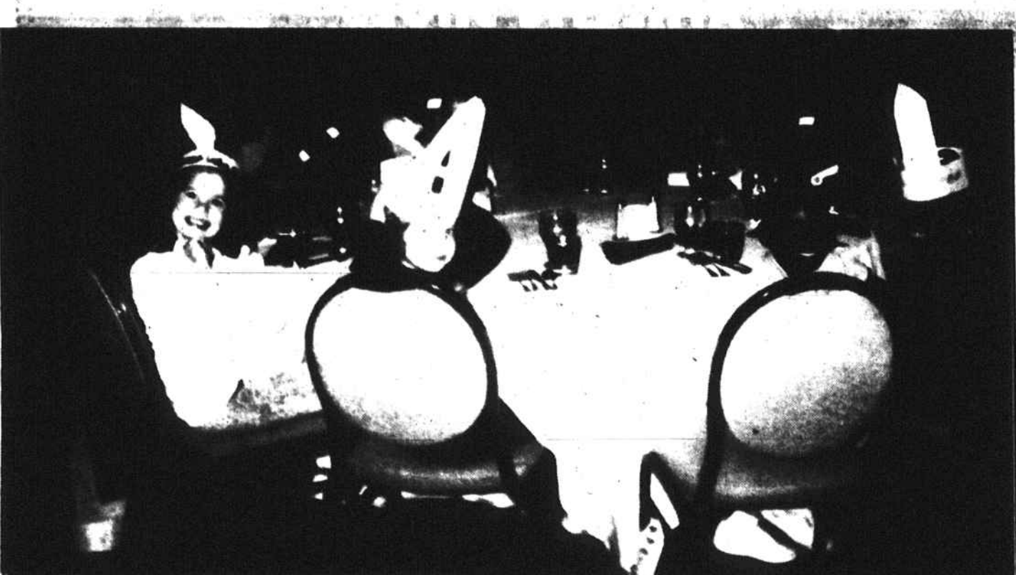
Students from Mineral Springs celebrate Thanksgiving Feast

Equal Housing Lender. Member FDIC. *Consult your tax advisor for specific details on deductibility of interest.