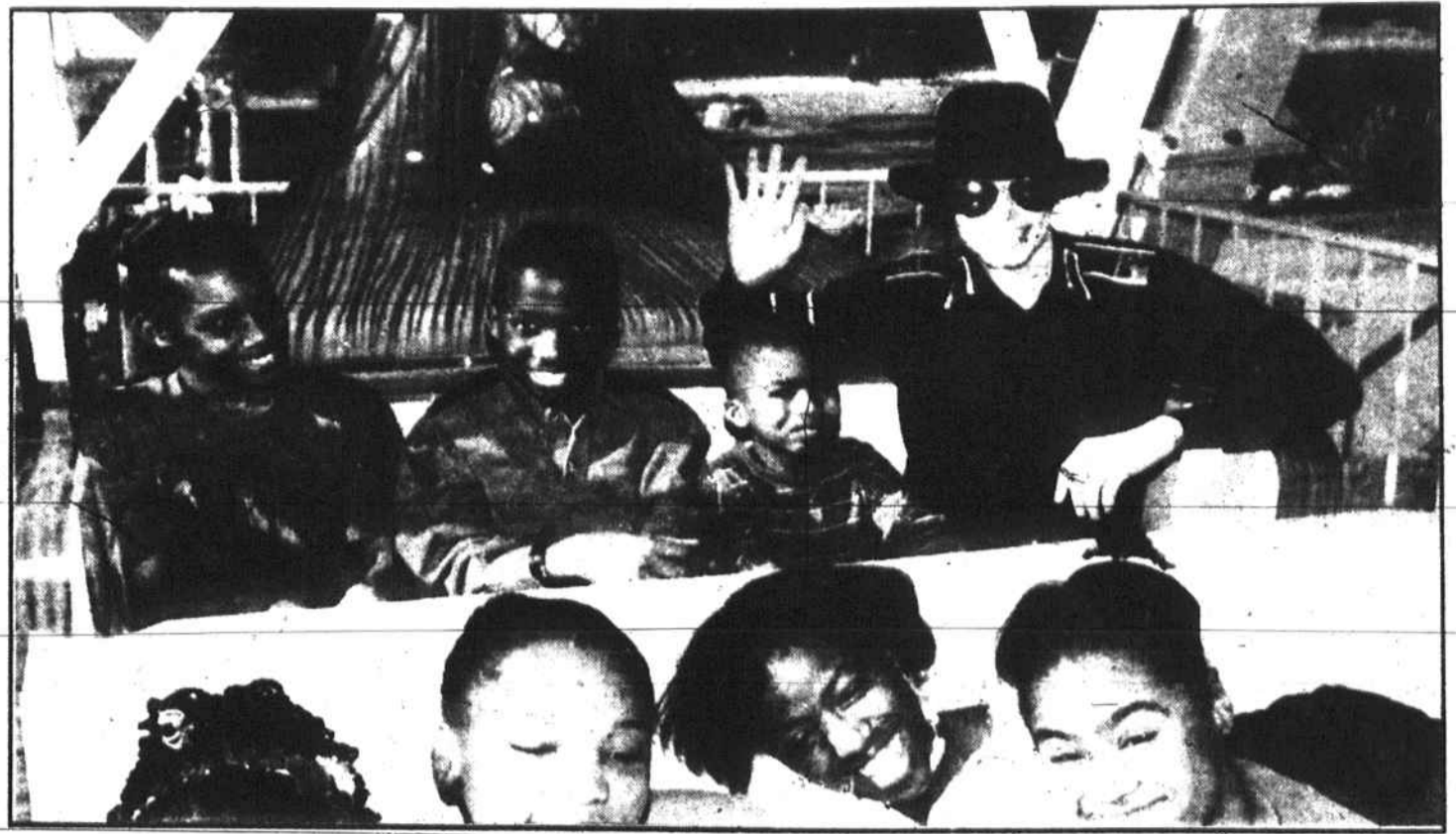
Michael Jackson waves from a carnival ride with unidentified youngsters as he hosts a Martin Luther King Jr. holiday party at his Neverland Ranch at Los Olivos, Calif., Saturday. The embattled superstar hosted some 100 children from South-Central Los Angeles at his 2,600-acre ranch.

Under the current leadership of William F. Gibson, the NAACP and its board have cemented what appears to be an excellent partnership with Benjamin F. Chavis Jr., the new executive director/CEO, and the youths of America.