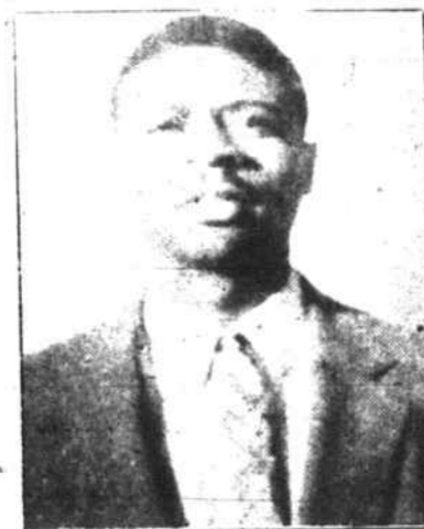
"I Have Moved"