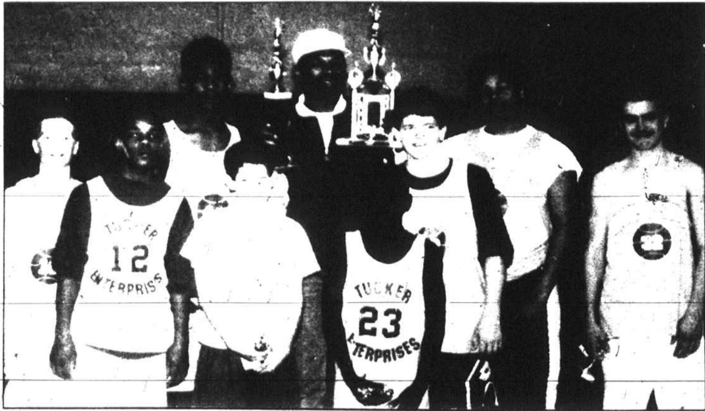
The Magic, winners of the Hanes Hosiery 12-15 basketball league.