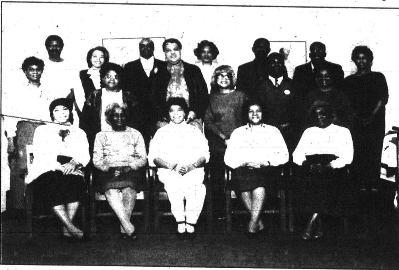
Members of the Save our Youth Concert Committee