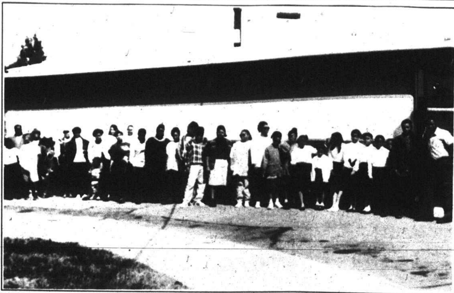
The Save Our Youth Community Choir get ready to leave to go to Fayetteville to open for the N.C. State Beauticians and Cosmetologist Convention.