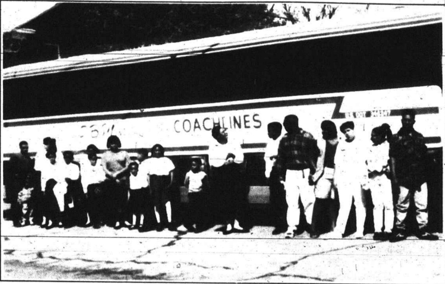
The children wait to board the bus for the convention.