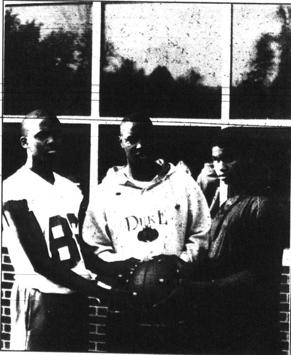
Some members of the Winston Lake 15-under AAU Team.

Both teams will try to shoot for that elusive national title and yet another piece of history.