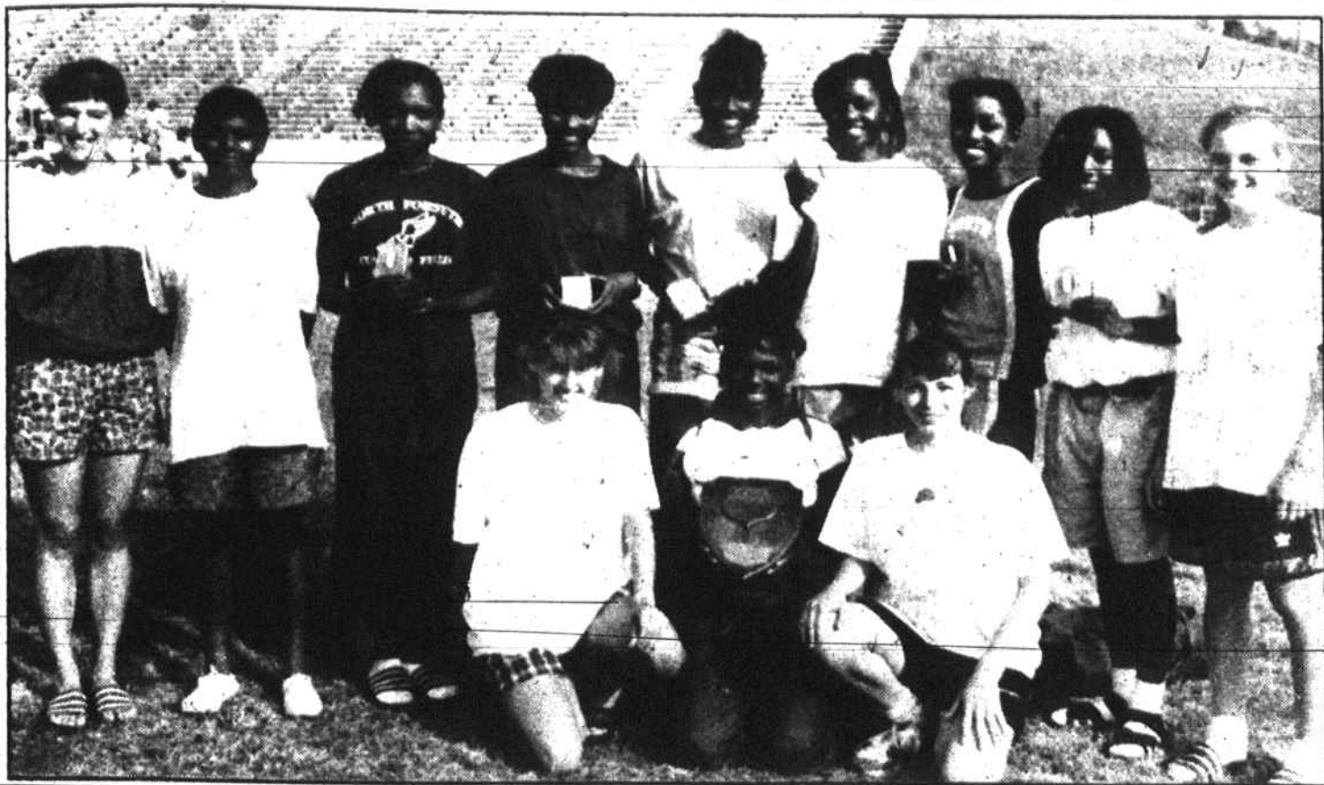
Girl Championship Team