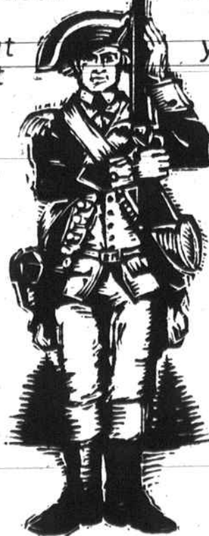
Colonial Williamsburg is as big a blast today as it was in 1776.

Day 3. But you don't want to miss all the good times in Norfolk. You want to lose yourself in the virtual reality of Nauticus, the amazing new National Maritime Center. You want to gaze with awe at the biggest ships in the world. You want to see the art of the renowned Chrysler Museum. You want to stuff yourself full of fresh seafood at Waterside.