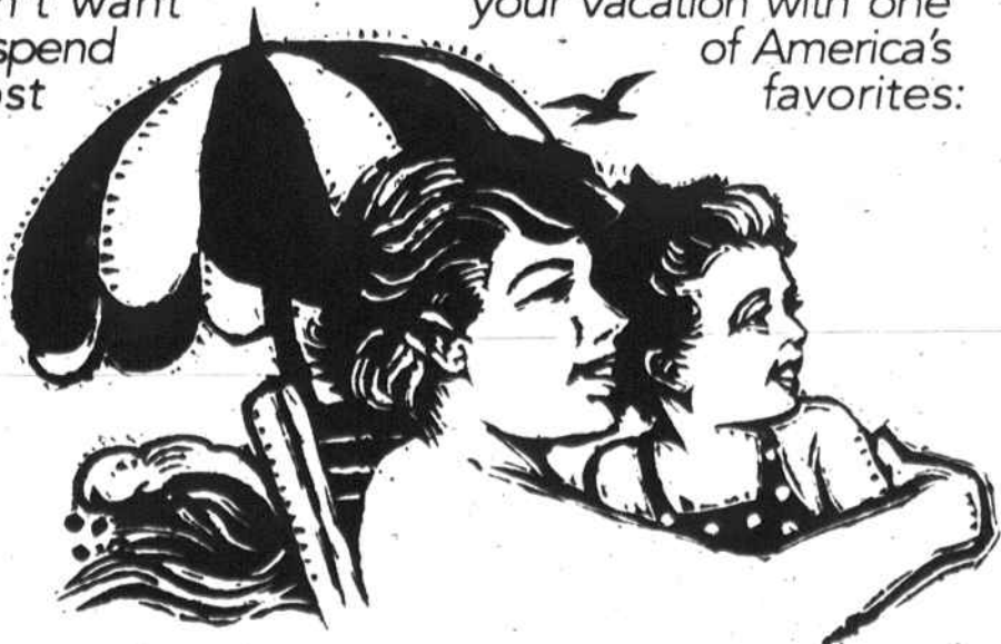
Virginia Beach offers 28 miles of boating, bathing, and biking down the boardwalk.

Day 1. Let's start your vacation with one of America's favorites: