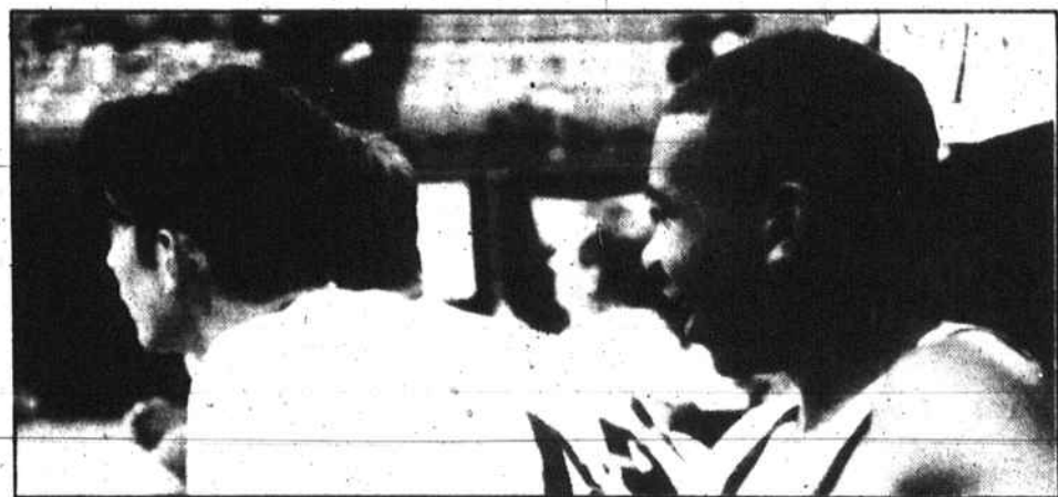
The AAU Junior Boys national tournament began July 16 with the championship scheduled for July 23.