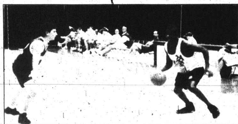
The best shot at exposure is at national AAU tournaments where dozens of college coaches flock to evaluate talent.