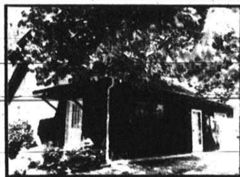
4861 TIFFANY —Great Country Club location! 3 bedrooms, 2 baths, completely redecorated. Move in condition.