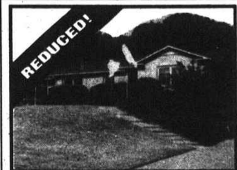
2920 SPRINGHAVEN DR.-EXCELLENT CONDITION! —3BR, 3 1/2BA, finished playroom in basement. Truly a great house w/lots of room & a beautifully landscaped yard, screened porch & deck.

OUR HOMES ARE MOVING TOO FAST FOR PHOTOS! YOUR HOME COULD BE HERE! CALL ME TODAY!