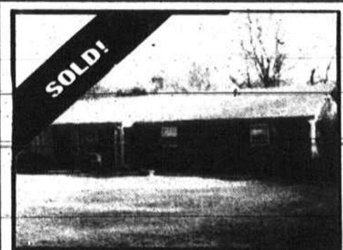
1420 FAIRCREST-GREAT LOCATION, WELL MAINTAINED BRICK RANCHER —Convenient location to Sara Lee, Wal-Mart and North Point. Excellent storage.

Let Us Open the Door to Home Ownership for You!