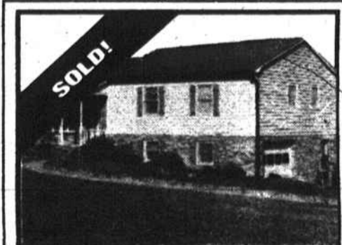
3767 DAY ROAD-WALKERTOWN DELIGHT!!! —3BR split level on a large lot. Spacious living area w/ plenty of room for a family. Bsmt gar., finished bsmt playroom, and a beautiful view off back deck.

DOWN PAYMENT ASSISTANCE PROGRAM AVAILABLE ON ANY OF THESE HOMES!