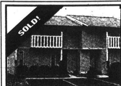
2474 TANTELON PLACE—4BR/3BA condo w/2,300 sq. ft. on 18th hole. Hdwd. floor, full finished bsmt. and pool & tennis courts give this condo everything you could want. Great price.