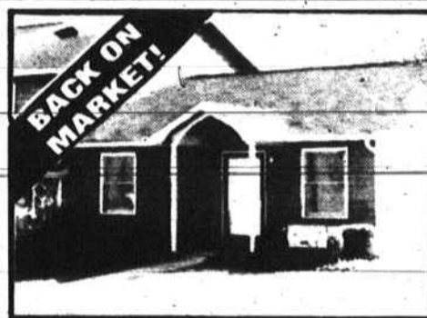
501 ROCKCLIFF COURT-WON'T LAST LONG! —2BR townhome, decorated with flair, custom treatments. Patio w/ privacy, won't last long. Owner/Agent.