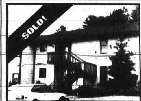
143 SOUTHRIDGE-EXCELLENT CONDITION! —Updates include new heat pump, wallpaper & carpet. This condo is priced below tax value! 2BR, 2BA, deck w/view.