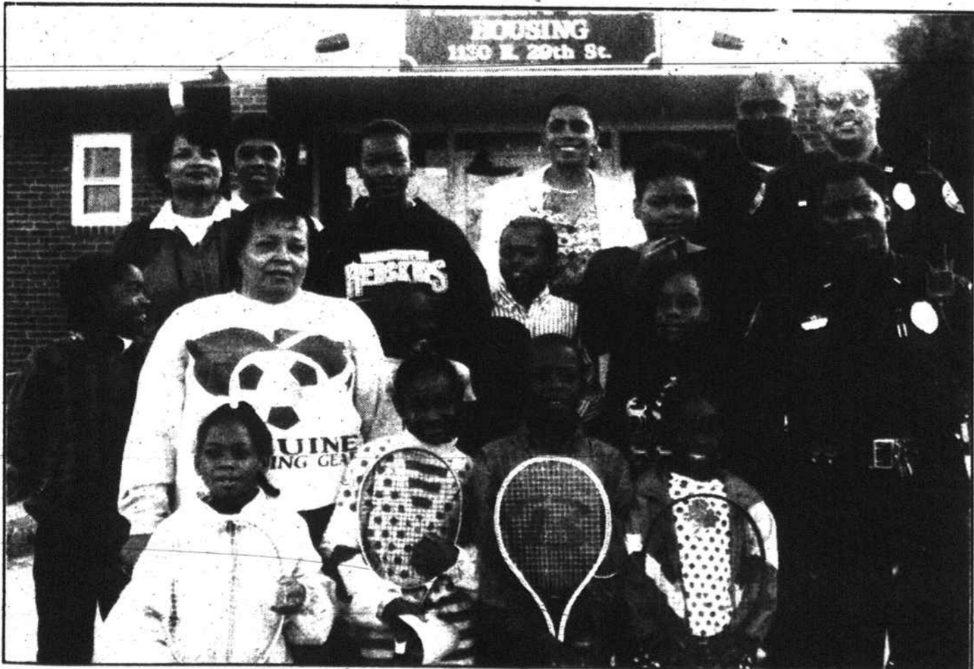
Participants and volunteers in the Kimberly Park Tennis Club's Junior Program shared a moment before their awards program Sept. 22 at Piedmont Park Community Center. The program teaches tennis fundamentals and etiquette by bring together volunteers who share their time and talent with the youngsters. The first-year program, which is aimed at boys and girls ages 8 to 12, completed its first six-week session recently and began another last Saturday.