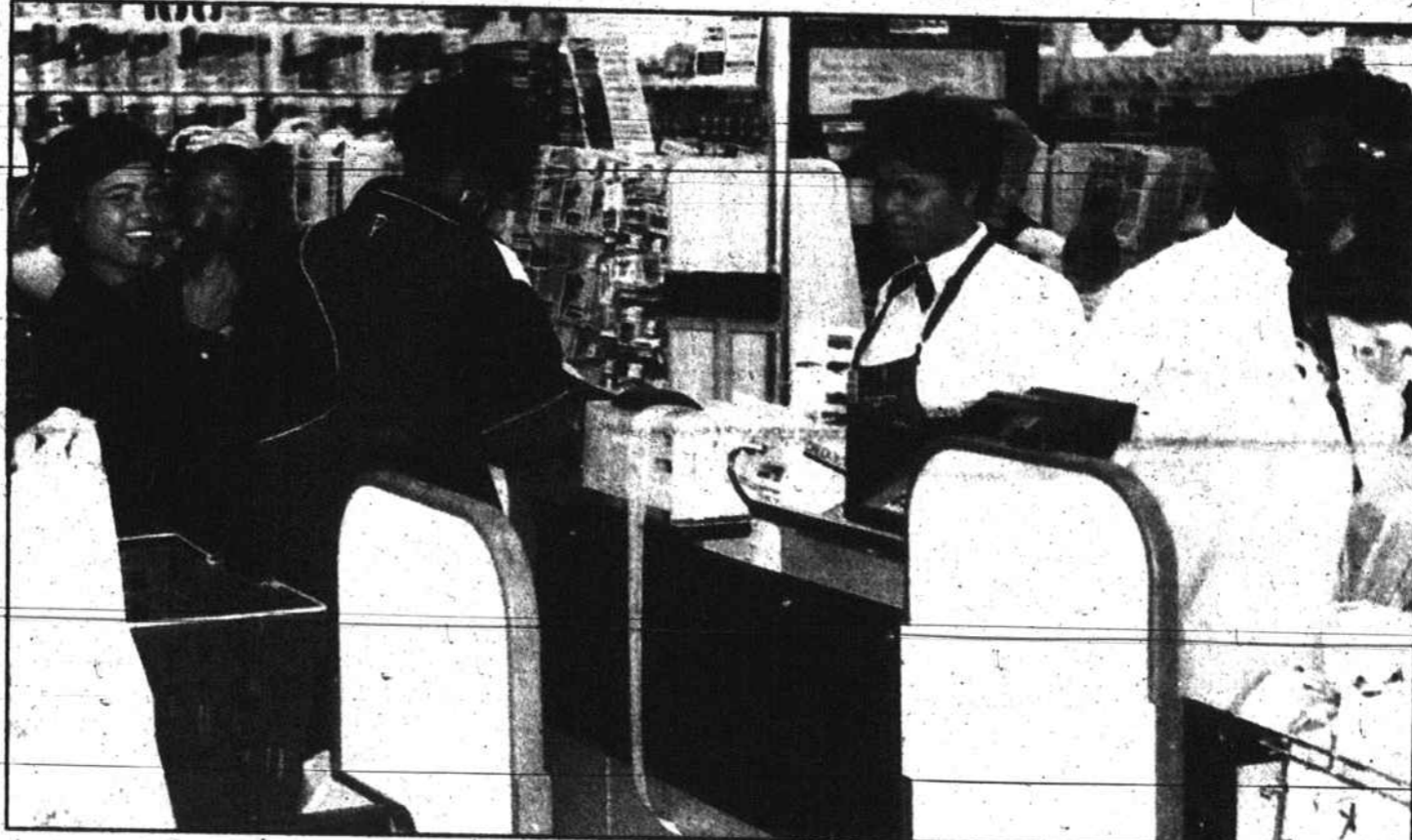
Shoppers flocked to the grand opening last Wednesday of BI-LO grocery store at Eastway Plaza Shopping Center on New Walkertown Road.